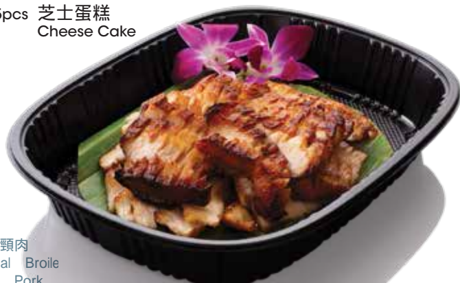
炭燒豬頸肉 Charcoal Broile Tender Pork