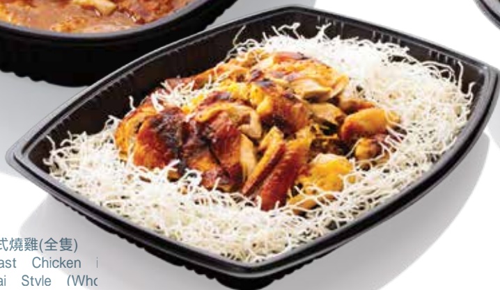
泰式燒雞(全隻) Roast Chicken i Thai Style (Whc