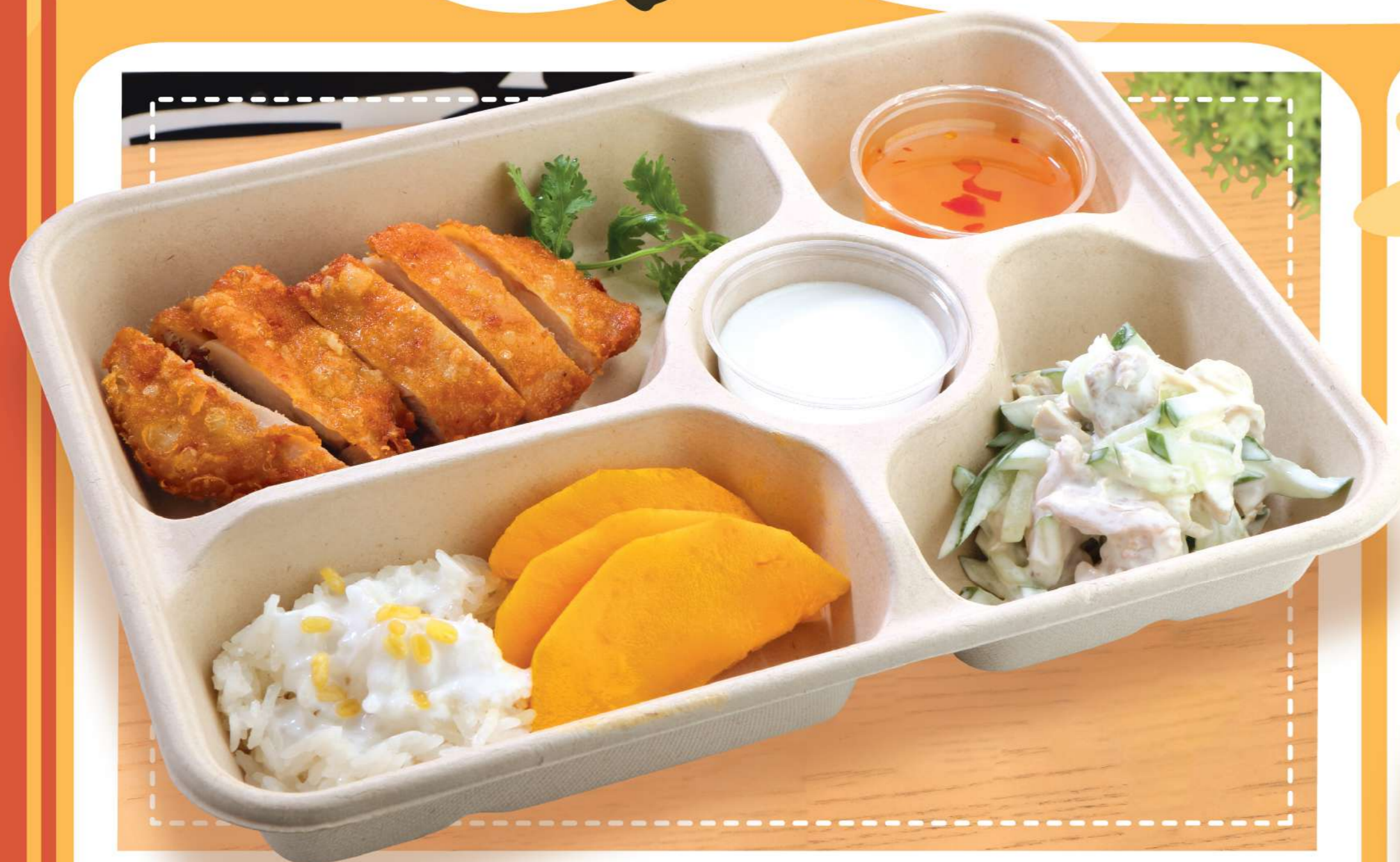
Thai Mama Deep Fried Chicken Platter 泰媽媽炸雞拼盤 $52

Thai Mama Deep Fried Chicken 泰媽媽炸雞 + Cucumber and Sliced Chicken Salad 青瓜、雞絲沙律 + Mini Mango with Glutinous Rice 迷你芒果糯米飯