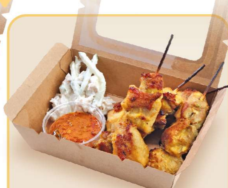
Chicken Satay (4pcs) 雞肉沙嗲串 $45