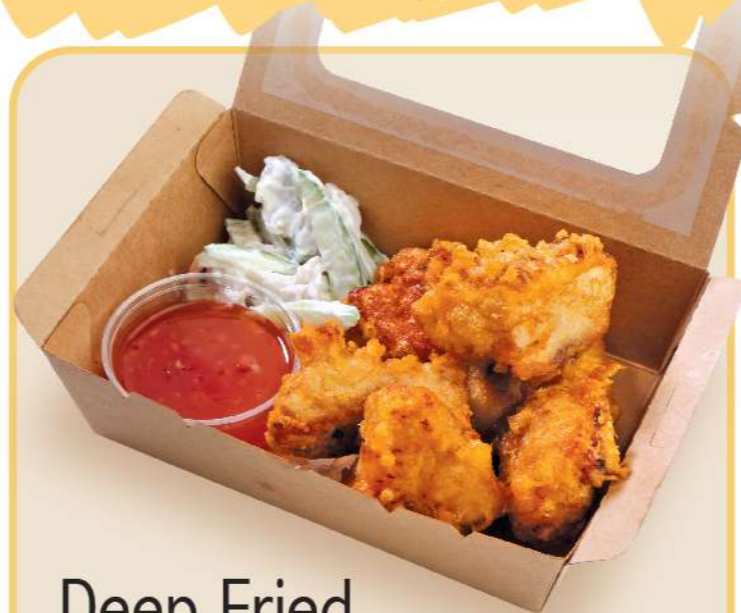
Deep Fried Chicken Nugget (6pcs) 泰式炸雞球 $45