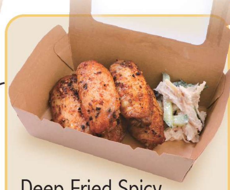
Deep Fried Spicy Chicken Wing 5pcs 香辣雞中翼 $52

all the snacks item will serve (Cucumber Salad) 以上小食配(青瓜沙律) Complimentary of Thai Milk Tea(Hot/Cold) or Lime Soda 包一杯泰式奶茶(熱/凍) 或青檸梳打