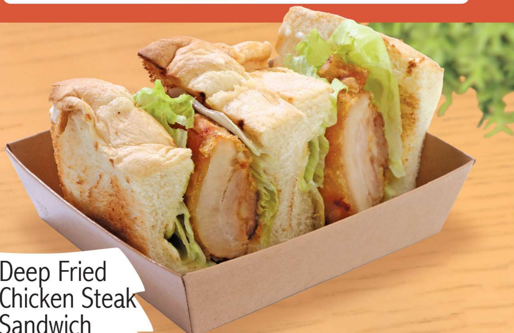
Deep Fried Chicken Steak Sandwich 炸雞扒多士三文治 $40