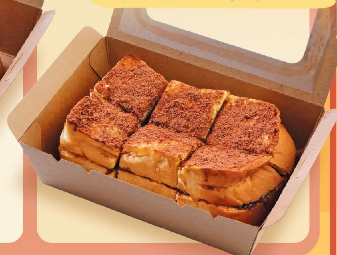
Nutella and Milo Toast 榛子醬、美祿多士